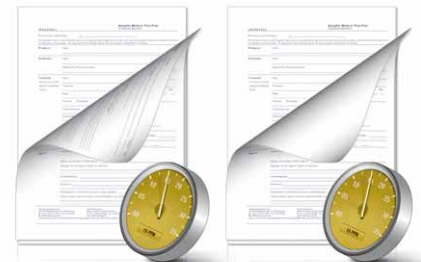
Duplex output at simplex speeds

Create double-sided prints and copies without compromising on productivity. As the MP 2000LN takes care of duplex output at simplex speeds, you need not worry about delays. Along with saving on paper costs, you safeguard the environment.